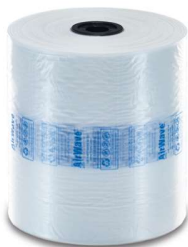
ECO (15 µm)