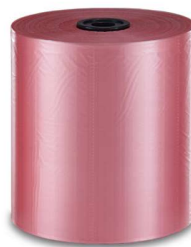
ESD (20 µm) antistatic