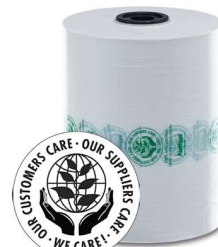
BIO (20 µm) Home-compostable