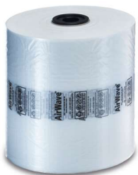
Standard (20 µm)