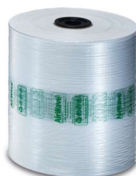
Super ECO (12 µm)