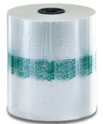
Heavy Duty (26 µm)